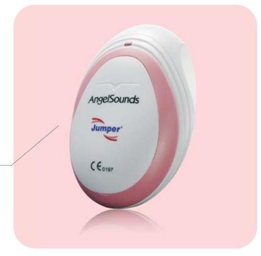
JPD -100Smini Model