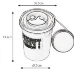
Model: DMS-R1 (Capacity: 1.0L)