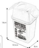
Model: DMS-T1B (Capacity: 1.0L)