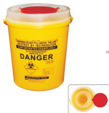
Model: DMS-R8 (Capacity: 8.0L)