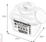
Model: DMS-F10 (Capacity: 10.0L)