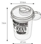
Model: DMS-R2.4 (Capacity: 2.4L)