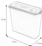
Model: DMS-T4.6B (Capacity: 4.6L)