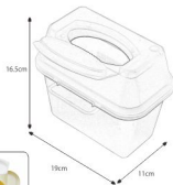
Model: DMS-T2 (Capacity: 2.0L)