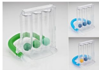
Model: DMS-A1 (Capacity: 600cc/900cc/1200cc per sec)