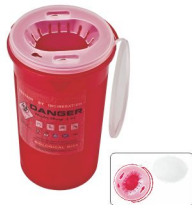
Model: DMS-R3A (Capacity: 3.0L)