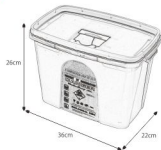
Model: DMS-F23 (Capacity: 23.0L)