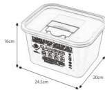
Model: DMS-F06 (Capacity: 6.2L)