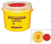
Model: DMS-R6 (Capacity: 6.0L)