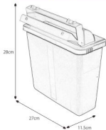
Model: DMS-T4.6A (Capacity: 4.6L)